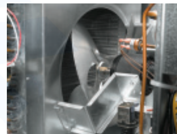
Unique fan-blade design helps reduce noise

With a unique fan-blade design, quieter compressors, and a special sound shield, Prodigy™ cubers reduce the noise of ice making versus competing models. All external panel components are crafted for superior fit and finish and aesthetic appeal. For the ultimate in quiet operation, Prodigy Eclipse offers the ability to locate the compressor, condenser and receiver remotely. Noise and heat are moved away from workers and customers, improving surroundings.