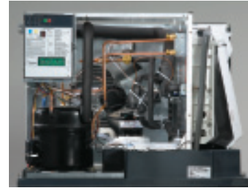
Open design with all components accessible

Preventative maintenance, including descaling, is now simple. The Prodigy™ unit's front and side panels can be easily removed, allowing clear access to internal components without the need to remove any parts or move the machine. Inside, a diagnostic code display helps technicians determine any operating issues quickly, ensuring equipment is fixed right the first time.