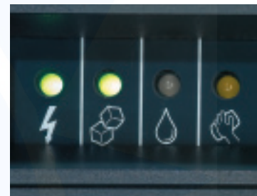
Easily monitor status without opening up the cabinet

Prodigy™ AutoAlert™ external indicator lights continually communicate the machine's current status for complete confidence in its ice-making capability. The ability to immediately alert staff of key operational issues is a valuable tool in maintaining high levels of ice production and minimizing performance interruptions.