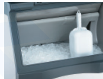
Take complete control of your ice-making level

Using field-proven ultrasonic technology, the Vari-Smart™ ice-level control maintains the ice level you set to keep just the right amount of freshly made ice in the bin. Along with the Smart-Board™ control, this feature allows you the flexibility to program your ice level for up to 7 days. That means customers get fresh ice while you save water and electricity.