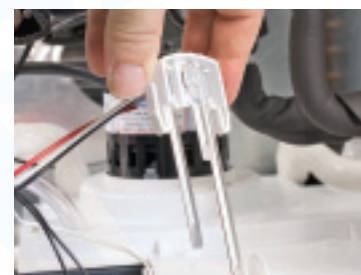
Electric conductivity-based water sensor

The patented WaterSense adaptive purge control reduces scale buildup by detecting hard water conditions and purging mineral laden water with every freeze cycle for maximum reliability and a longer time between cleanings. It constantly measures the minerals in the water and automatically adjusts the purge water amount to minimize scale buildup in every type of water.