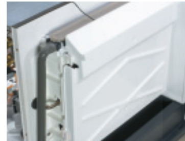
Helps keep your ice fresh and pure

All Prodigy™ cubers are protected with Scotsman AquaArmor™, which utilizes AgION®, a silver-based antimicrobial compound molded directly into key ice-machine components. This built-in compound reduces the growth of bacteria, microorganisms, algae, mold, and slime on ice-machine surfaces. Match this with Scotsman's other sanitation products to further defend your ice machine against undesirable microbes, bacteria, mold, and algae. Refer to the water filtration and sanitation matrix to match the right cleaning product to your water conditions.