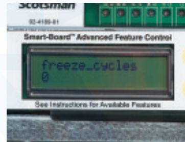
Diagnostic capabilities on screen or transmitted remotely

This optional advanced feature control provides you with operational data that can be displayed on-screen or transmitted remotely for early alert and fast diagnosis of operational issues. With this optional feature, Prodigy™ cubers meet NAFEM data protocol capabilities for smart kitchen applications.