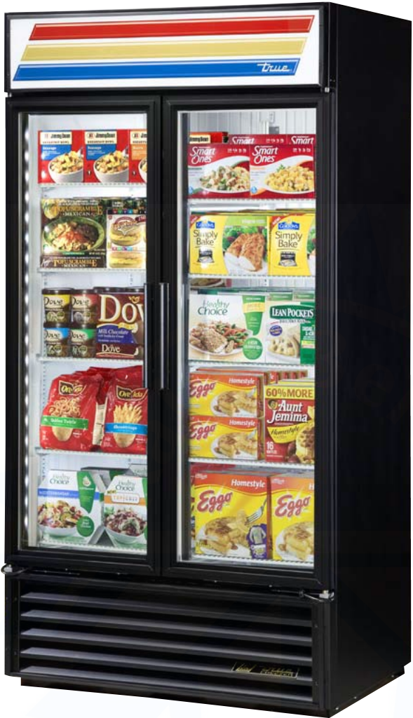
Shown with optional black exterior.