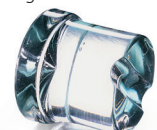
Ø 38 x H 41 mm

This product qualifies for the following listings: