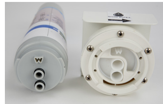
Arctic Pure Plus unique locking manifold