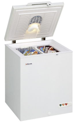
100 MM INSULATION