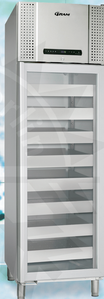
BioPlus 500. Drawers and glass door are optional extras.

Available in either white or stainless steel finish, with well-insulated glass or solid doors.