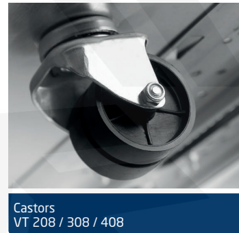
Castors VT 208 / 308 / 408