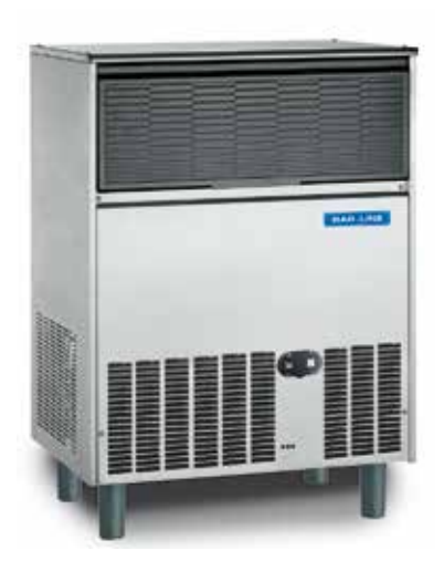
B 9040 AS/WS

Bar Line Equipment range is the newly released EU made ice makers for Thimble-shaped rounded ice cubes coming from Bar Line.