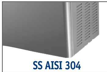
SS AISI 304